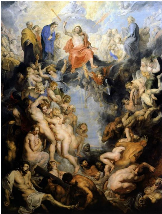
The Great Last Judgement Peter Paul Rubens, 1617